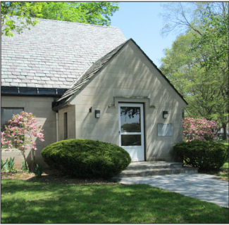
Evergreen Crematory in spring

Evergreen Cemetery Association of New Haven & Crematory 769 Ella T. Grasso Blvd. New Haven CT 06519