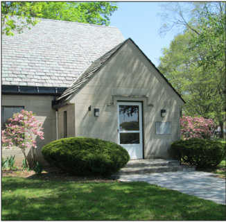
Evergreen Crematory in spring

Evergreen Cemetery Association of New Haven & Crematory 769 Ella T. Grasso Blvd. New Haven CT 06519