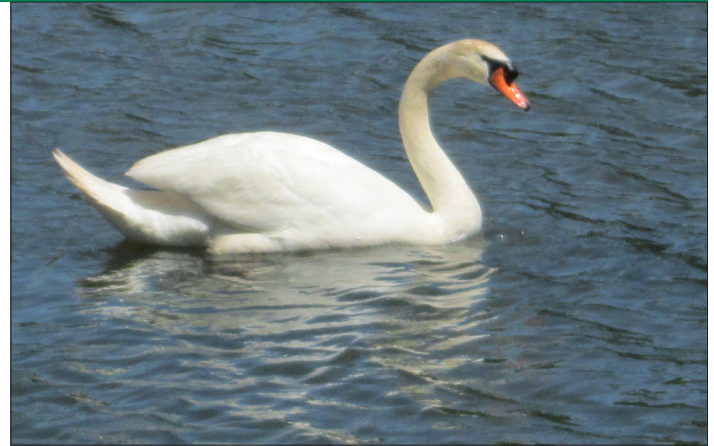
The gracefulness of a swan as it traverses the pond of Evergreen. So many of our bird species live in harmony.

Our Columbarium and The Most Beautiful Cremation Garden is looking fabulous with great new colorful