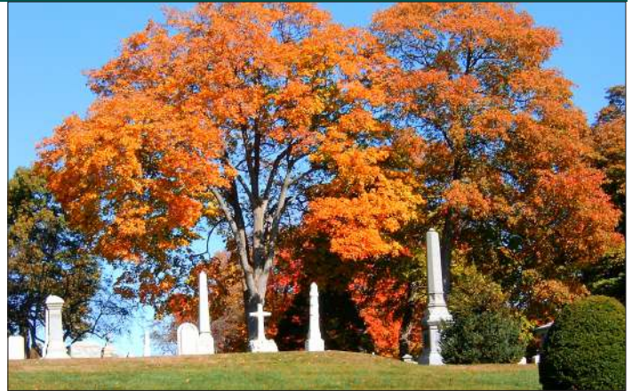
Beauty is all around us. Let's rejoice in the plethora of color.

Another choice is applying for the Veterans plaque if you have honorably served in the armed forces. This has