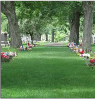
The beauty of family care.

Evergreen Cemetery Association of New Haven & Crematory 769 Ella T. Grasso Blvd. New Haven CT 06519