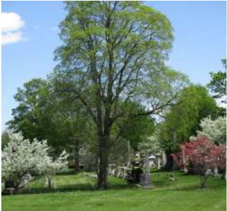
The beauty of spring & summer

Evergreen Cemetery Association of New Haven & Crematory 769 Ella T. Grasso Blvd. New Haven CT 06519