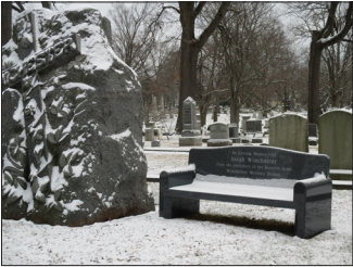
Sarah Winchester's silent bench in winter.

Evergreen Cemetery Association of New Haven & Crematory 769 Ella T. Grasso Blvd. New Haven CT 06519