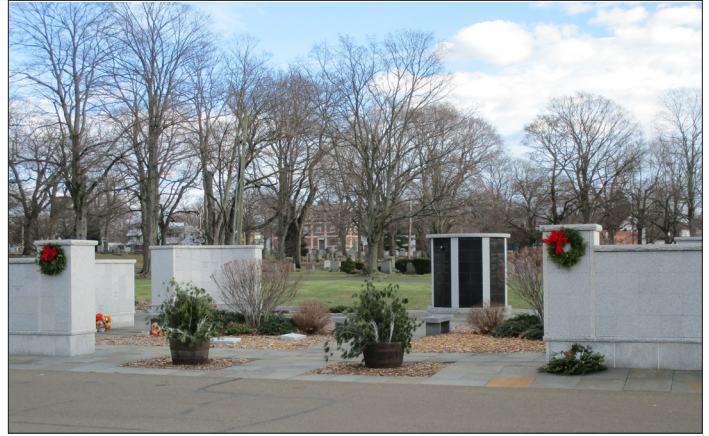
The Columbarium and Most Beautiful Cremation Garden.

If you need to purchase a monument or marker, it is not too late. We set monuments and markers throughout the winter season. We have just received a new shipment of gravestones, so you will have your choice of