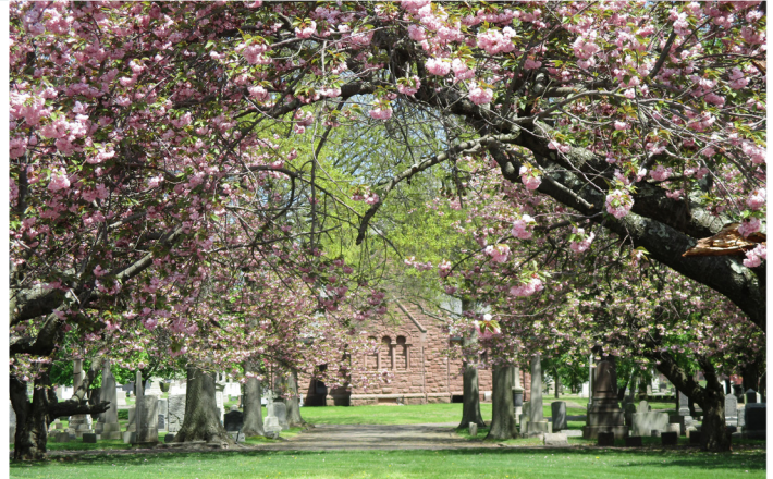
The Chapel as viewed through the blossoms of spring.

Finally, we would be amiss if we didn't mention the beauty of nature on the pond. We are hopeful that the swans, ducks, and geese