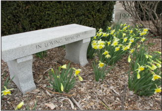
A bench for remembrance or to ease the soul.

Evergreen Cemetery Association of New Haven & Crematory 769 Ella T. Grasso Blvd. New Haven CT 06519